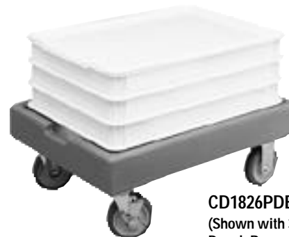
CD1826PDB (Shown with 3 each stacked Pizza Dough Boxes Product #DB18263CW)